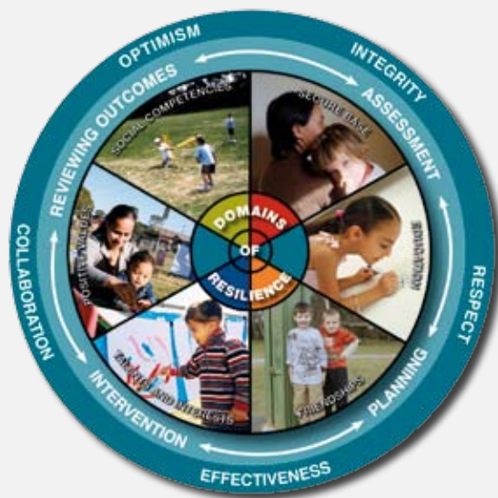
Figure 1: Domains of Resilience

The Benevolent Society uses the 'domains of resilience' model as a means for driving assessment & intervention. The model is used in combination with an ecological framework that demonstrates the levels at which resilience factors can be located.